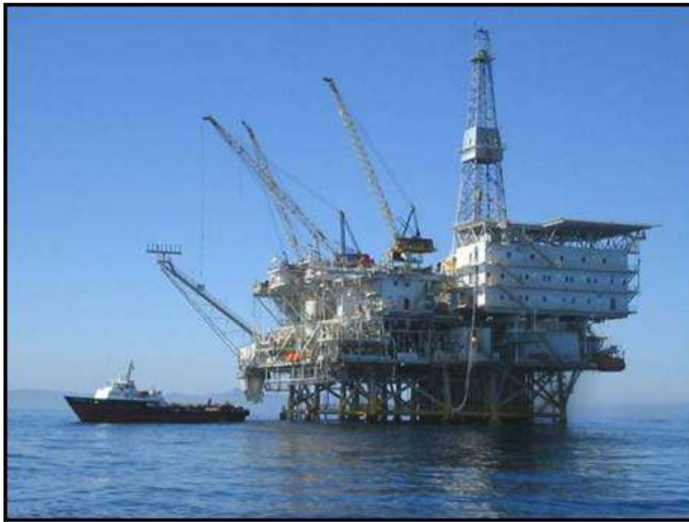
7 8 9 10 11 12 13 14 15 16 17 18 Platform Hondo.

1 55. Oil and gas production has occurred under these leases from Platform 2 Harmony, Platform Heritage, and Platform Hondo. Platform Harmony was 3 installed in June 1989 and first production began in December 1993. Platform 4 Heritage was installed in October 1989 and first production began in December 5 1993. Platform Hondo was installed in June 1976 and first production began in 6 April 1981.