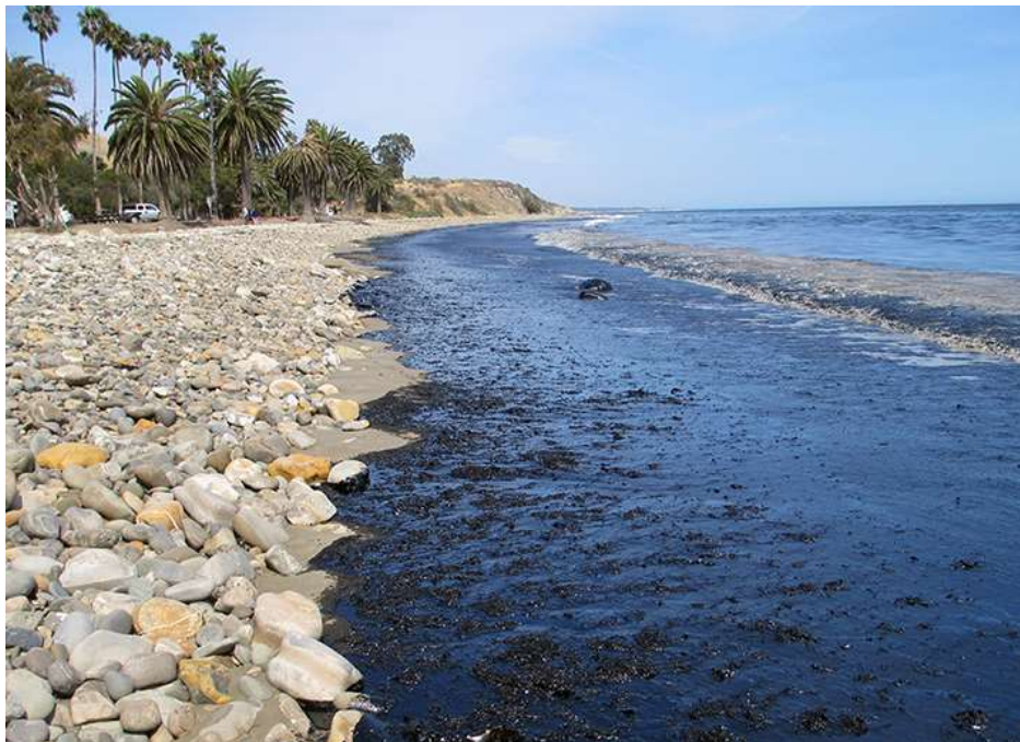
18 Oil spilled onto Refugio Beach.

4 58. This change of ownership follows a May 20, 2015, oil spill from the 5 Plains All American Pipeline, which ruptured and spilled what is now believed to 6 be up to 460,000 gallons of oil on the Santa Barbara Coast. The oil spill closed 7 beaches and killed wildlife.