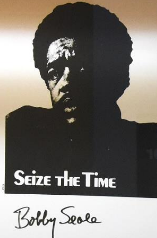
Portrait of Bobby Seale. At the height of the Civil Rights Movement, Seale and Huey P. Newton co-founded the Black Panther Party in Oakland in October 1966. The caption is the title of Seale's book, Seize the Time: The Story of the Black Panther Party and Huey P. Newton , published in 1970. Bobby Seale signed the placards for the Black Panther Party during a speaking event at San Jose State University on August 24, 2013. Berkeley / Oakland, circa May 1970.