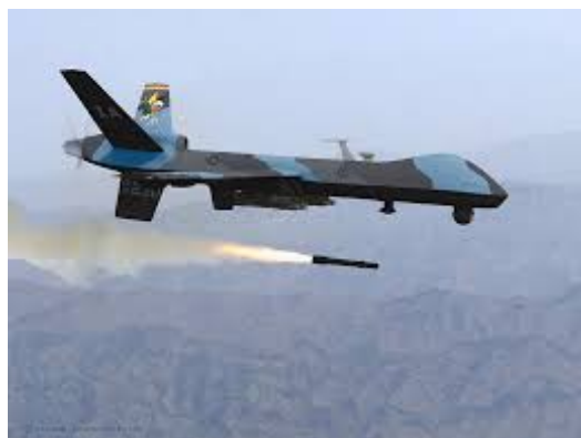
“REAPER”: US Military Assassin Drone (A Remote-controlled Killer)

MOST PEOPLE KILLED BY US MILITARY ASSASSIN DRONE MISSILES ARE NOT EVEN THE TARGETS