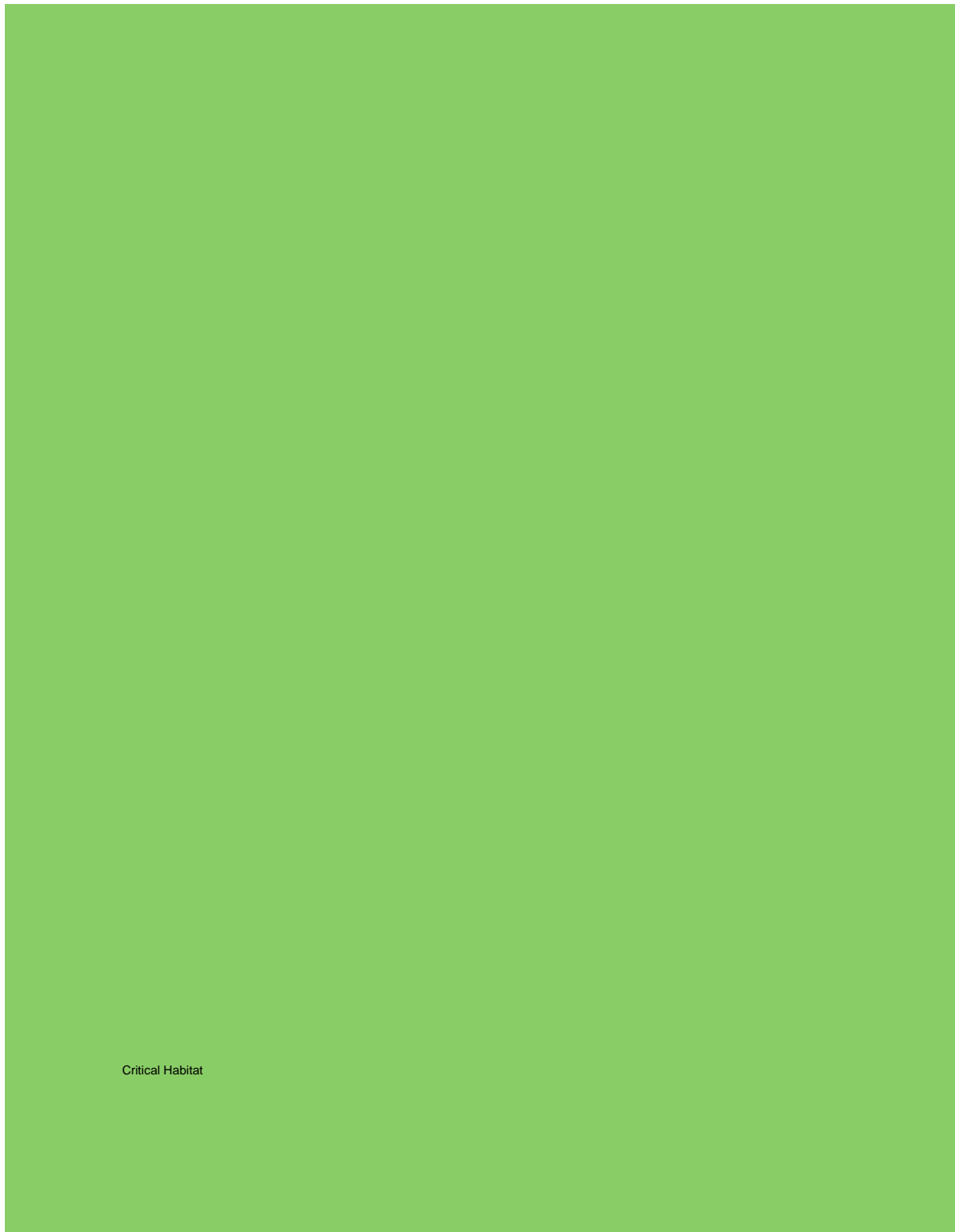
Figure 2: Critical Habitat for Central California tiger salamander