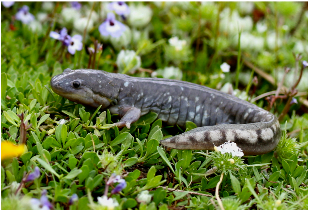
California tiger salamander at Jepson Prairie, Solano County.