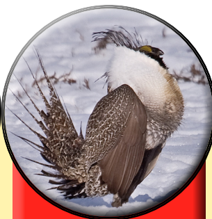
Greater sage grouse