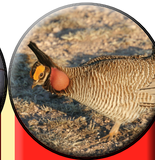
Lesser prairie chicken