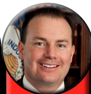
Sen. Mike Lee (R-Utah) 10 attacks