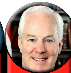
Sen. John Cornyn (R-Texas) six attacks