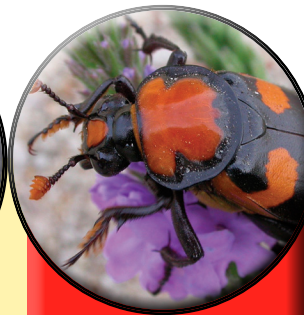
American burying beetle