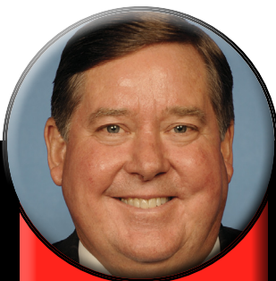
Rep. Ken Calvert (R-Calif.) 10 attacks