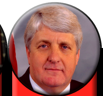
Rep. Rob Bishop (R-Utah) five attacks