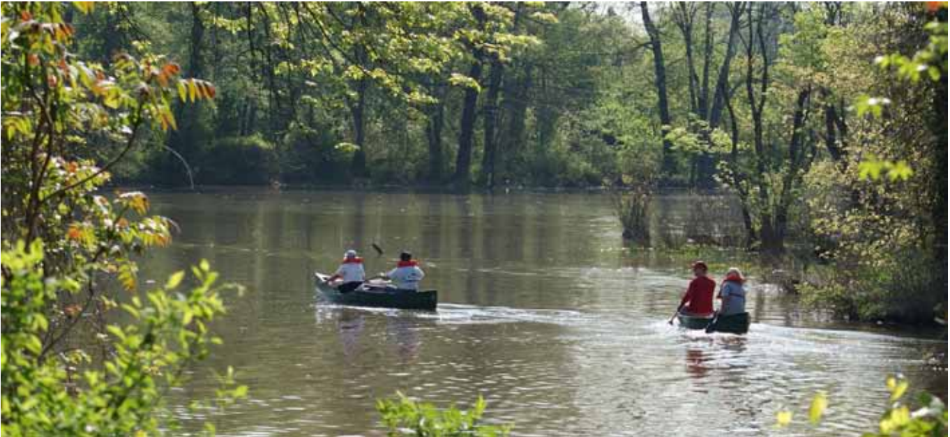
Citizen and government efforts to reduce trash in the Anacostia River have cleaned up the river and create hope for swimming and fishing there in coming years.