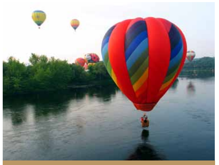
Balloonists fly over – and make a spectacle of dipping into – the scenic Androscoggin River during the annual Great Falls Balloon Festival in Lewiston and Auburn, Maine.