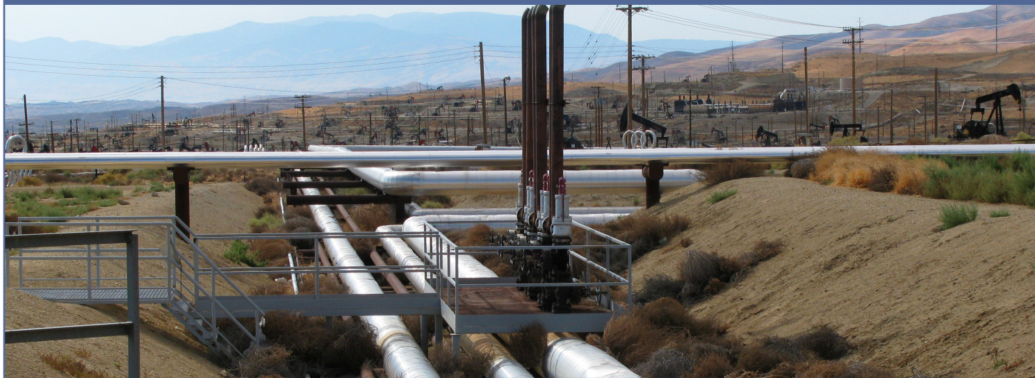
MIDWAY-SUNSET OIL FIELD, KERN COUNTY