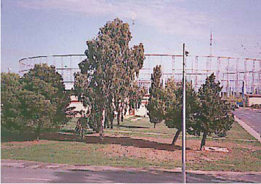
This was the view from the balcony of my dorm at PPD Base #1.