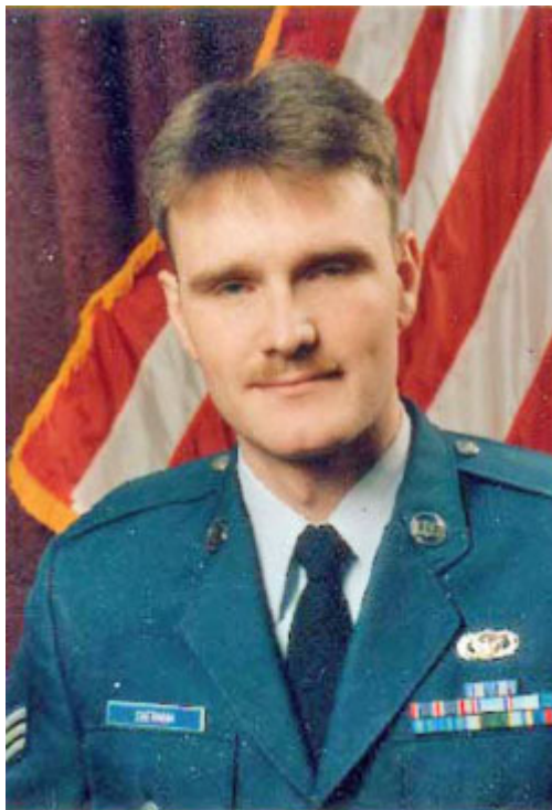
An official portrait taken in 1986.