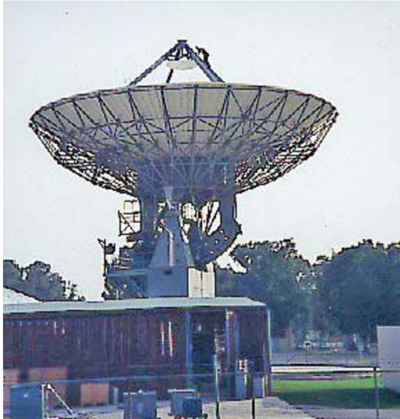
Here, I'm pictured climbing on of our parabolic antennae. This is the antenna under the white dome pictured in the last photo. This was during deconstruction of the site. You can see part of one of the C-Vans in the lower right corner.