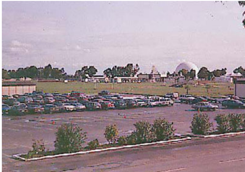
Another view from the balcony of my dorm. The white dome in the distance is where I worked.