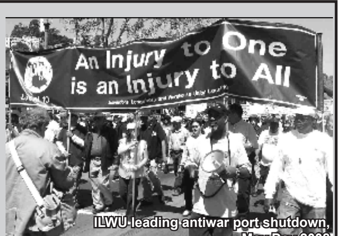
ILWU leading antiwar port shutdown, May Day 2008