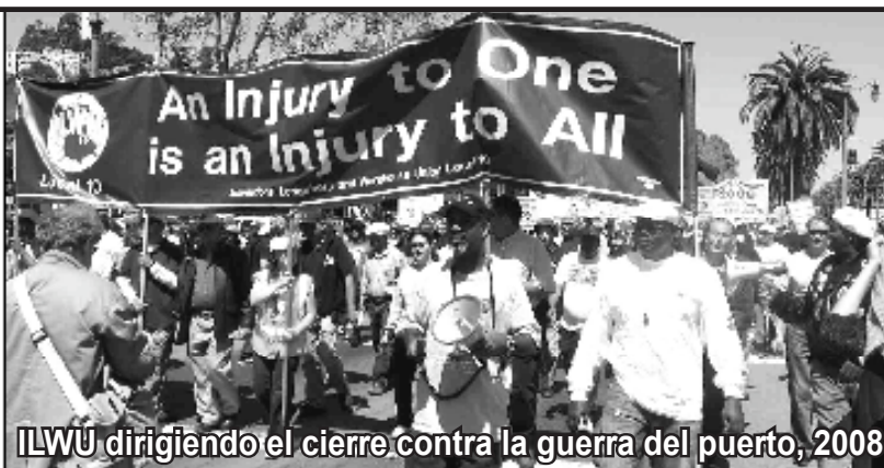
ILWU dirigiendo el cierre contra la guerra del puerto, 2008