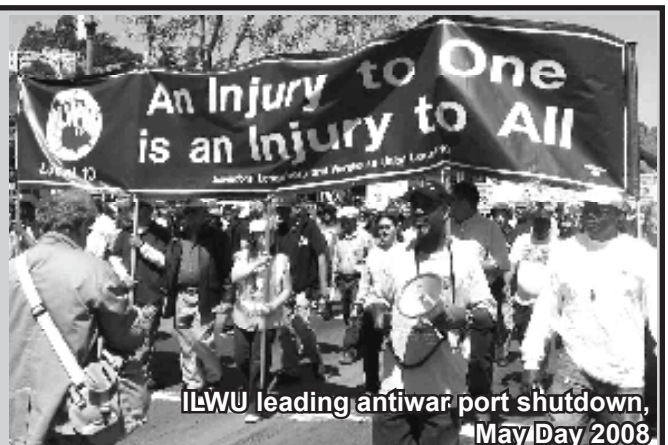
ILWU leading antiwar port shutdown, May Day 2008