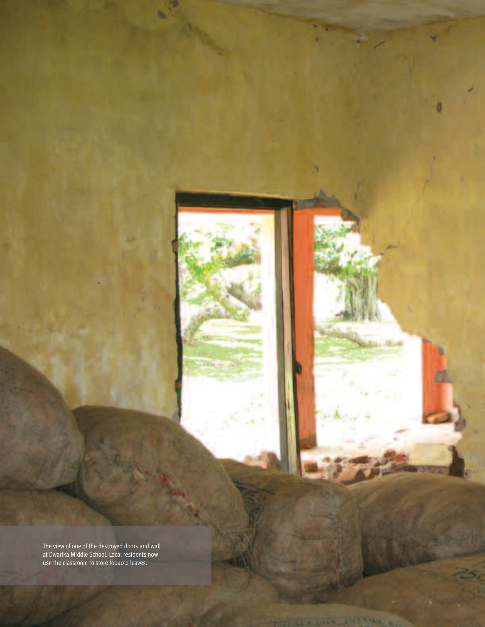
The view of one of the destroyed doors and wall at Dwarika Middle School. Local residents now use the classroom to store tobacco leaves.