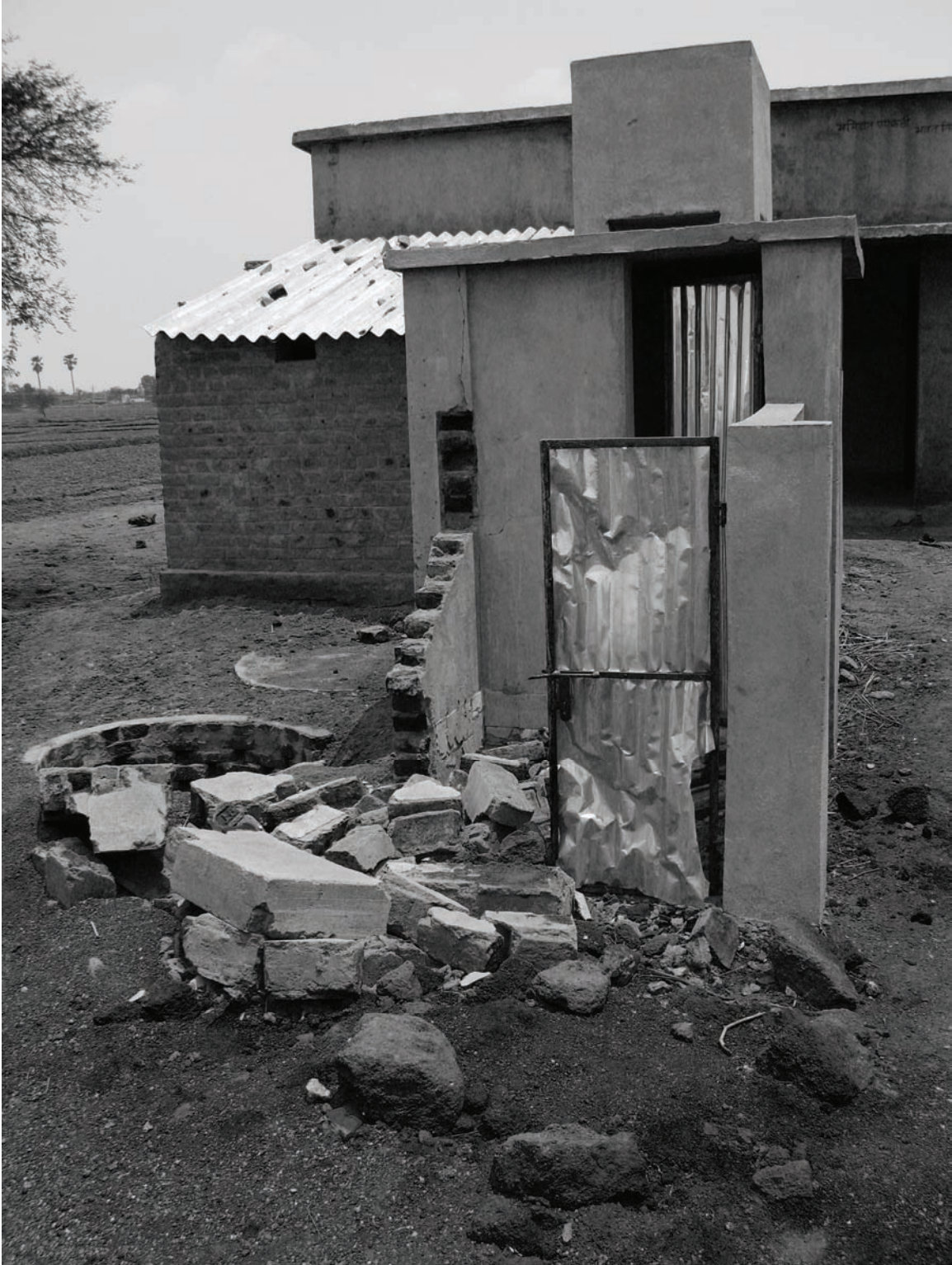
Figure 2: The damage cause to the toilet block at Barwadih Primary School, by an explosive device left by Naxalite fighters on April 11, 2009.