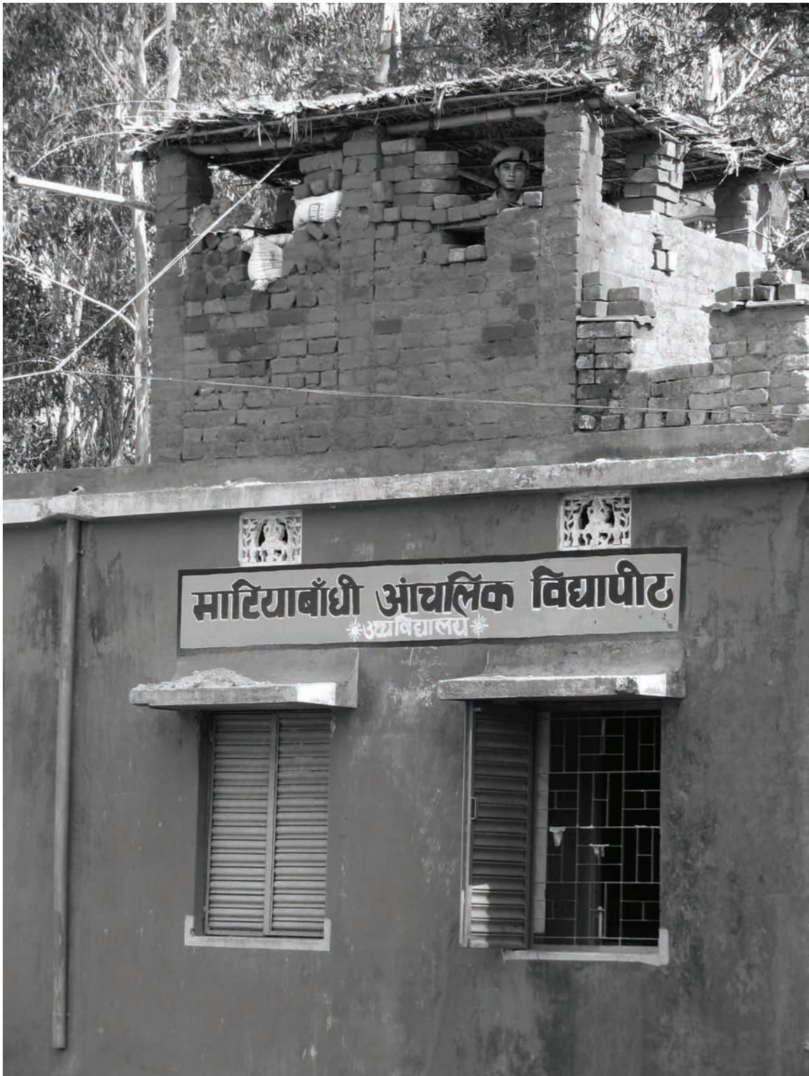
Figure 4: An armed paramilitary police force sentry guard surveys the surroundings from inside the brick fortification on the roof of Matiabandhi High School, Jharkhand.