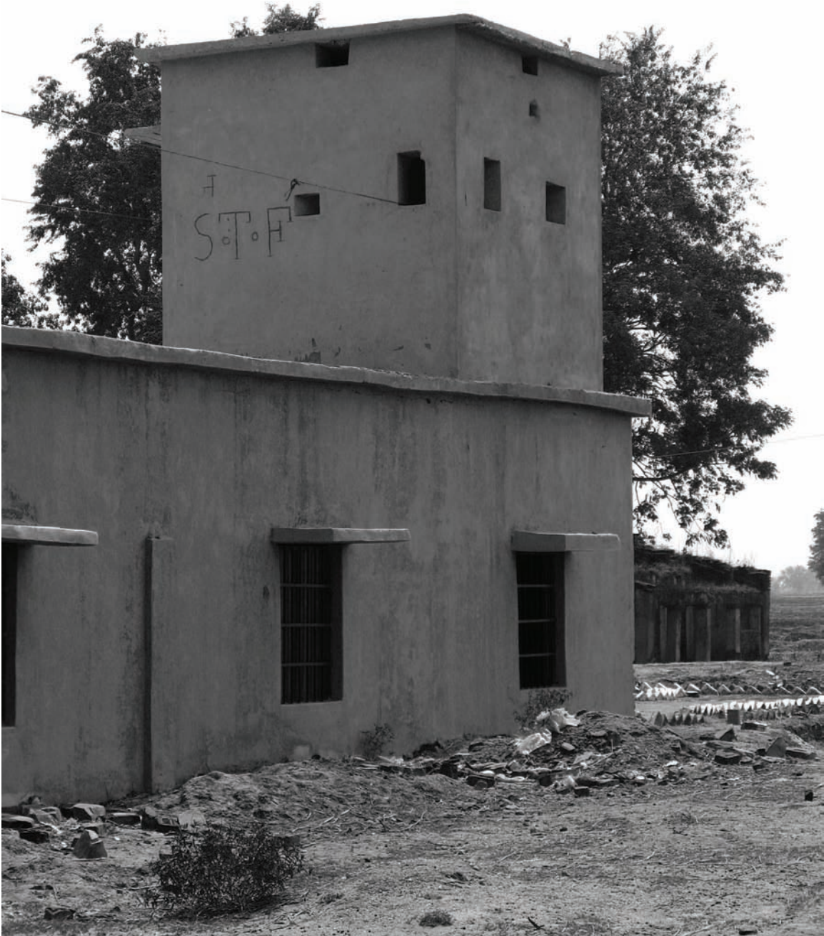
Figure 5: Graffiti reading “STF” (Special Task Force) is still visible on a sentry post atop Kamgarpur Primary School, Jharkhand, even though the police vacated the building for another government building almost adjacent.