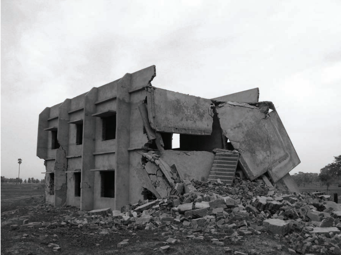
Figure 1: The damage caused to the new school building at Gosain-Pesra by a series of explosions set by Naxalite fighters on April 14, 2009.

In an anonymous article in CPI (Maoist) Information Bulletin in November 2008, in reaction to the Human Rights Watch report, “Being Neutral is Our Biggest Crime: Government, Vigilante, and Naxalite Abuses in India’s Chhattisgarh State,” 103 the author defended the Naxalites’ attacks on schools: