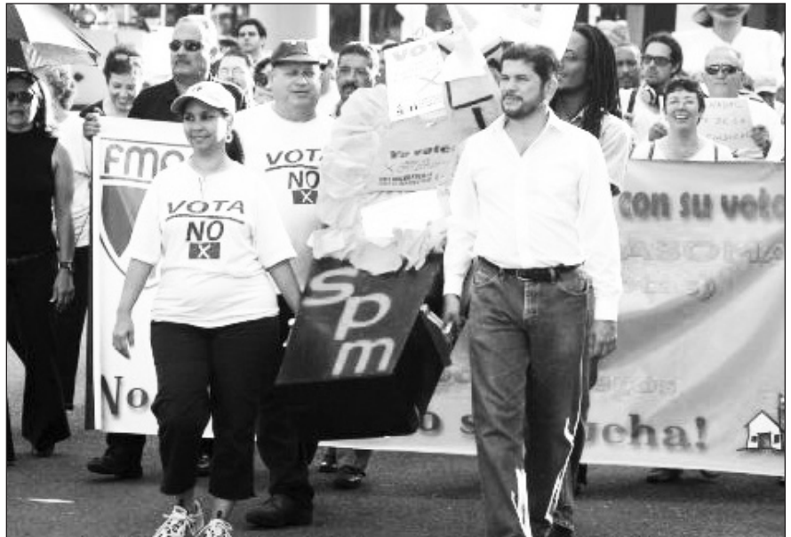
Mock burial of the SPM-ASOMA-SEIU representing its defeat on October the 29th

The teachers of Puerto Rico, once more, delivered a lesson in respect, trouncing the SPM/ASOMA Bosses Union and their cronies, the dues-hungry Service Employees International Union (SEIU), in the tainted referendum organized by the Commission of Labor Relations and the government-boss. Even though the numbers speak for themselves-- 18,125 NO votes, 14,675 YES votes—they do not adequately reflect the significance of the victory of the Teachers Federation of Puerto Rico (FMPR) and the Puerto Rican teachers, under the most adverse conditions. The government-boss in collusion with the Association of Teachers of Puerto Rico (ASOMA—the association consisting historically of principals, directors and administrators), through the Commission of Labor Relations, designed and organized the