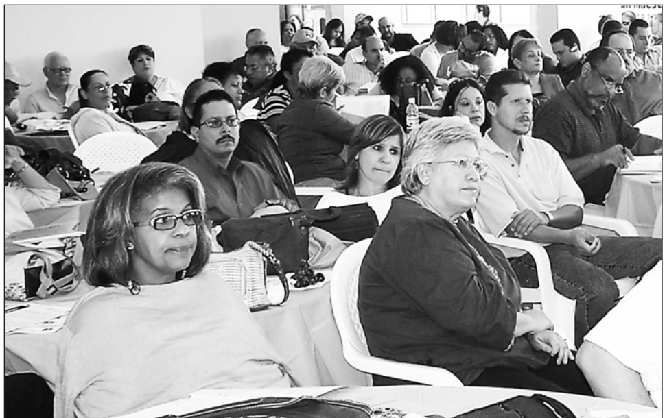
Stewards and teachers discuss strategies during the Summer Union Workshops in San Juan.