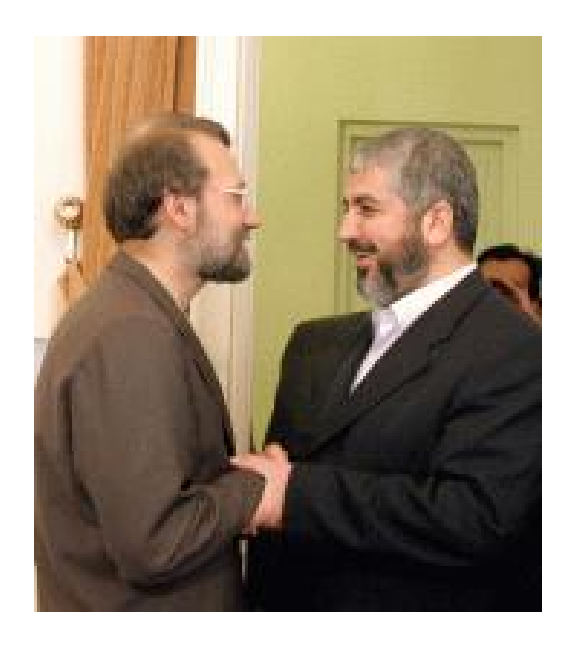
Iranian National Security Council Secretary Ali Larijani (L) an Khalid Mashaal (R) 12 Dec. 05.

"U.S. policies have proven to be a failure in dealing with regional problems, most obviously in Iraq, and today regional nations are witnessing a wave of objections and opposition toward U.S. policies