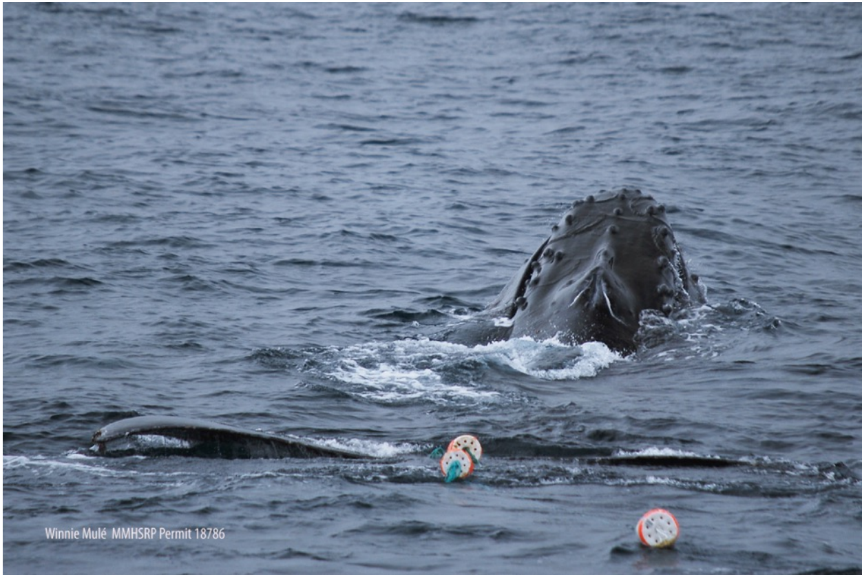
Entangled humpback whale trailing crab pot line and buoys. Monterey Bay on May 10, 2016