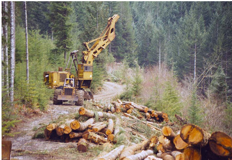
Figure 3. Logging destroys and degrades habitat of over half of the petitioned species.

The harmful effects of timber harvest on amphibians are long lasting. Scientists have concluded that population recovery from clearcutting requires 50–70 years (Petranka et al. 1993) or even longer (Petranka et al. 1994, Homyak and Haas 2009, Semlitsch et al. 2007).