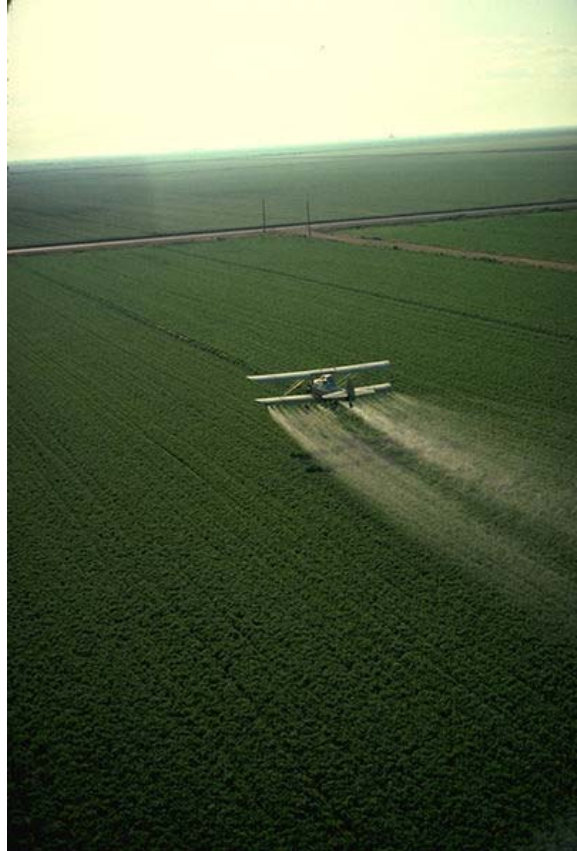
Figure 12. Pollutants such as pesticides threaten 30 percent of the petitioned species, especially the amphibians.