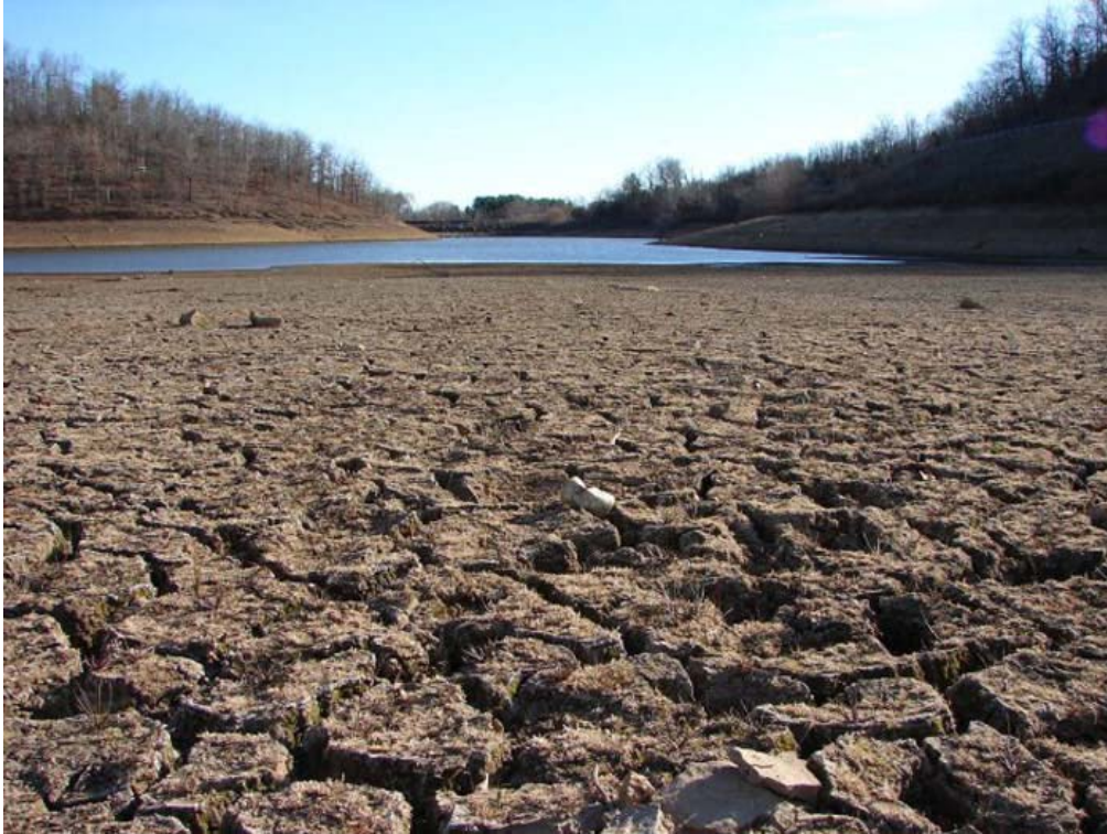
Figure 13. Increased droughts is one effect of climate change, which impacts many of the petitioned species.