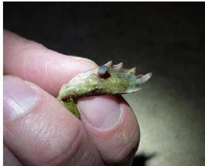
Figure 14. Spadefoot toads get their name from the spade on each hind foot that the toads use for digging.

The western spadefoot is placed in the genus Scaphiophus by some authors (NatureServe 2011). Hall (1998) argued against the recognition of Spea as a distinct genus, but most authors have accepted the split of Spea from Scaphiophus (Collins and Taggart 2009, NatureServe 2011).