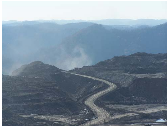
Figure 4. Mountaintop removal and other mining threatens several petitioned species, especially the salamanders.