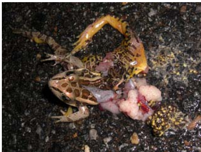
Figure 7. Road mortality threatens over half of the petitioned species of amphibians and reptiles.

Finally, roads can threaten herpetofauna through road avoidance (see Weatherhead and Prior 1992, Gibbs 1998a, Fitch 1999, Sealy 2002, Shine et al. 2004, Andrews 2004). In particular, barrier effects from roads have been observed in terrestrial and aquatic salamanders causing habitat fragmentation and isolation of populations (Gibbs 1998, DeMaynadier and Hunter 2000, Forman and Deblinger 2000, Jones et al. 2000, Marsh and Beckman 2004, Marsh et al. 2004, Marsh et al. 2005, Cushman 2006, Semlitsch et al. 2007). Correlations between road density and genetic distance in amphibians have been found (Reh and Seitz 1990, Hitchings and Beebe 1996, Boarman et al. 1997).