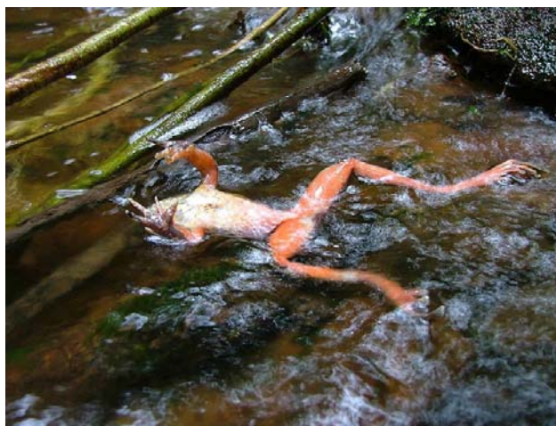
Figure 10. A chytrid-infected frog.

Recently, a soil-dwelling fungus, Chrysosporium , has been diagnosed as the cause of lethal facial lesions on eastern massasauga snakes ( Sistrurus catenatus catenatus ) (Parry 2012). Scientists fear that this fungus could “represent a new and devastating superbug,” that threatens many imperiled reptile species (Parry 2012), including the petitioned species.