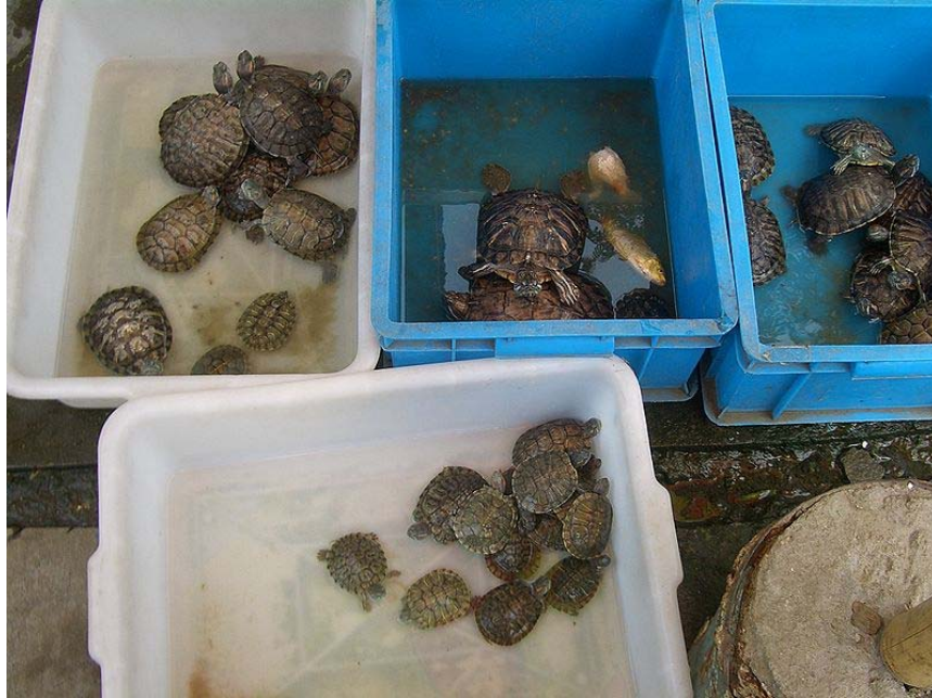
Figure 9. The petitioned turtles are especially vulnerable to overexploitation for the pet trade.