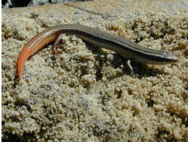
Plestiodon egregius