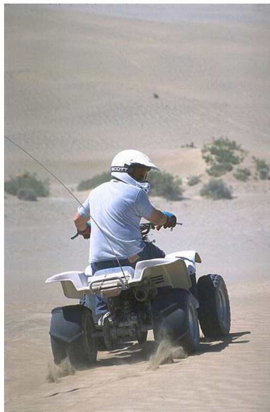
Figure 2. Off-road vehicles can degrade habitat and disturb herpetofauna.