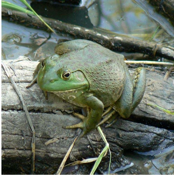
Figure 11. Introduced species, such as the bullfrog pictured here, threaten about one-third of the petitioned species.