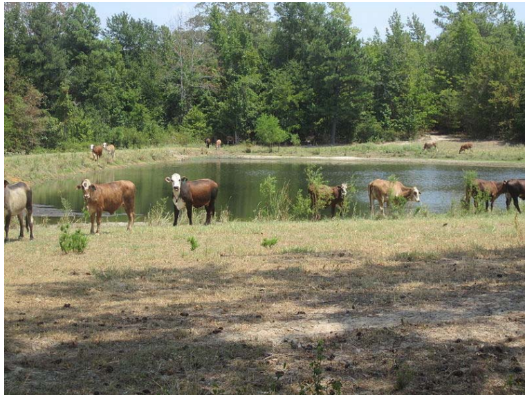
Figure 5. Poor grazing practices can degrade habitat for amphibians and reptiles.

Finally, grazing harms herpetofauna by contributing to the spread of invasive species. Livestock can cause weed invasion by grazing and trampling native plants; clearing vegetation, destroying the soil crust and preparing weed seedbeds through hoof action; and transporting and dispersing seeds on their coats and through their digestive tracks (Belsky and Gelbard 2000). In addition, ranchers sometimes plant exotic species for cattle forage, such as buffelgrass, which clogs habitat of wildlife such as the reticulate collared lizard, one of the petitioned species (Scott 1996). Livestock production can also facilitate the spread of invasive species through the construction of reservoirs, irrigation canals and watering holes for cattle, which create permanent waters utilized by invasive bullfrogs (Bury and Whelan 1984)