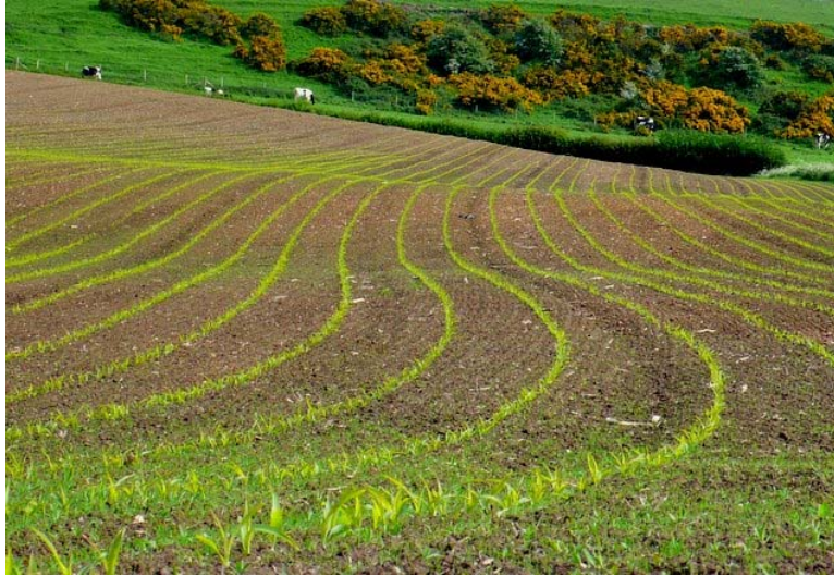
Figure 6. Agriculture threatens 40 percent of the petitioned species through habitat loss, exposure to pollutants, and direct mortality.