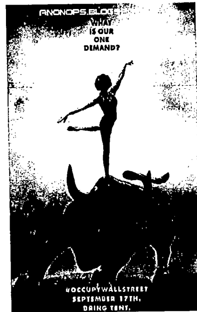
(U) Propaganda poster used by Anonymous to endorse the "Day of Rage" protest.

(U) Anonymous plans to release a new DDoS tool to the public called RefRef in September 2011, according to open source reporting. Anonymous has tested this tool with successful DDoS attacks on WikiLeaks, Pastebin b , and 4chan.org c . 4 Currently, it is unknown if the release date