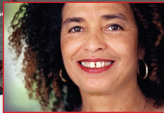
Angela Y. Davis