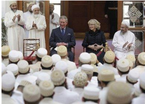
Prince Charles and the Duchess of Cornwall visit Masjid Dawoodi Bohra, Northolt, England: Feb. 4

In international relations, war is not the solution to problems, the Iranian diplomat reiterated.