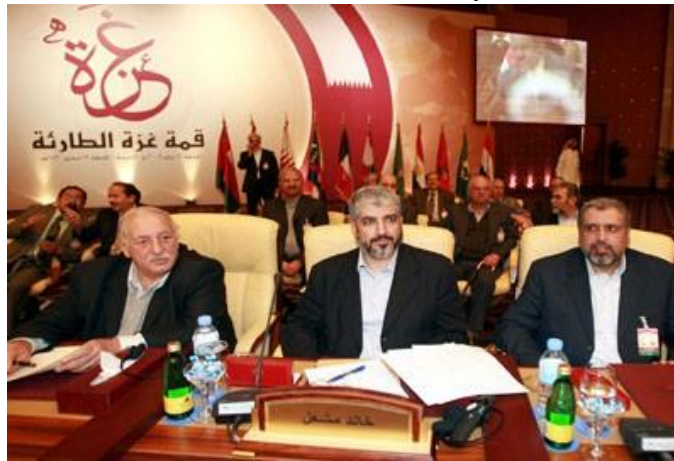
Ahmed Jibril, PFLP-GC (left), Khaled Mesha'al, Hamas (center), Ramadan Shallah, Islamic Jihad (right) at the "Arab Summit for the support of Gaza," Doha, Qatar Jan. 16, 2009

The Syrian Arab News Agency (SANA) reported that Chairman of the Hamas Politburo Khaled Mesha'al stressed on Friday the need for stopping the Israeli aggression on Gaza Strip, withdrawing occupation forces, lifting the siege and opening all crossing points, primarily the Rafah crossing point.