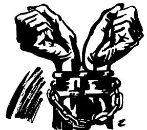
Labor Defender, December 1927

See reverse side for information about the prisoners supported by the Holiday Appeal.